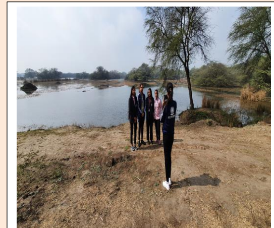
Short video shoot by Students of Department of environmental Science, FOSSC