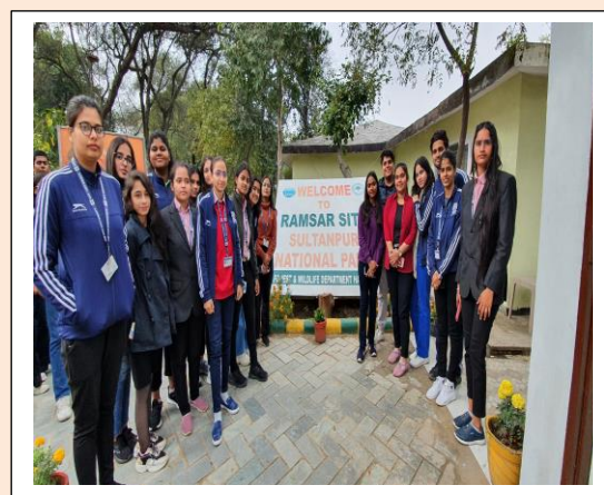
Students of FOSSC at the entrance of Sultanpur National Park, Gurugram