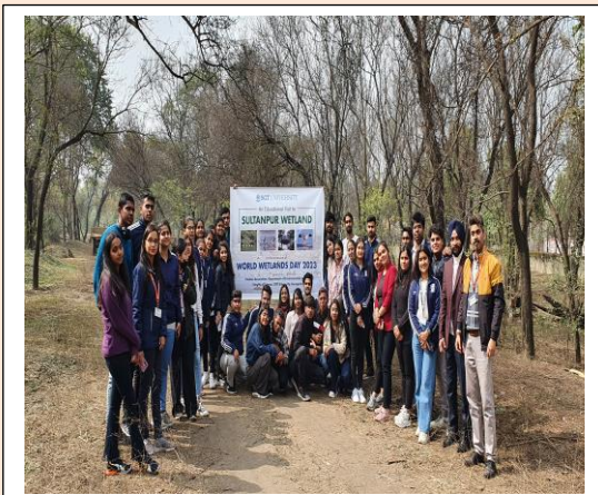
Students of FOSSC at Sultanpur National Park, Gurugram