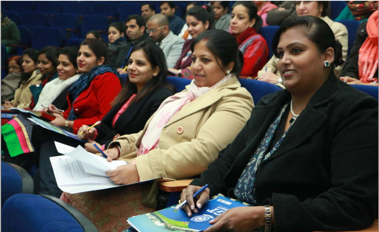
Faculty well Connected with the speaker