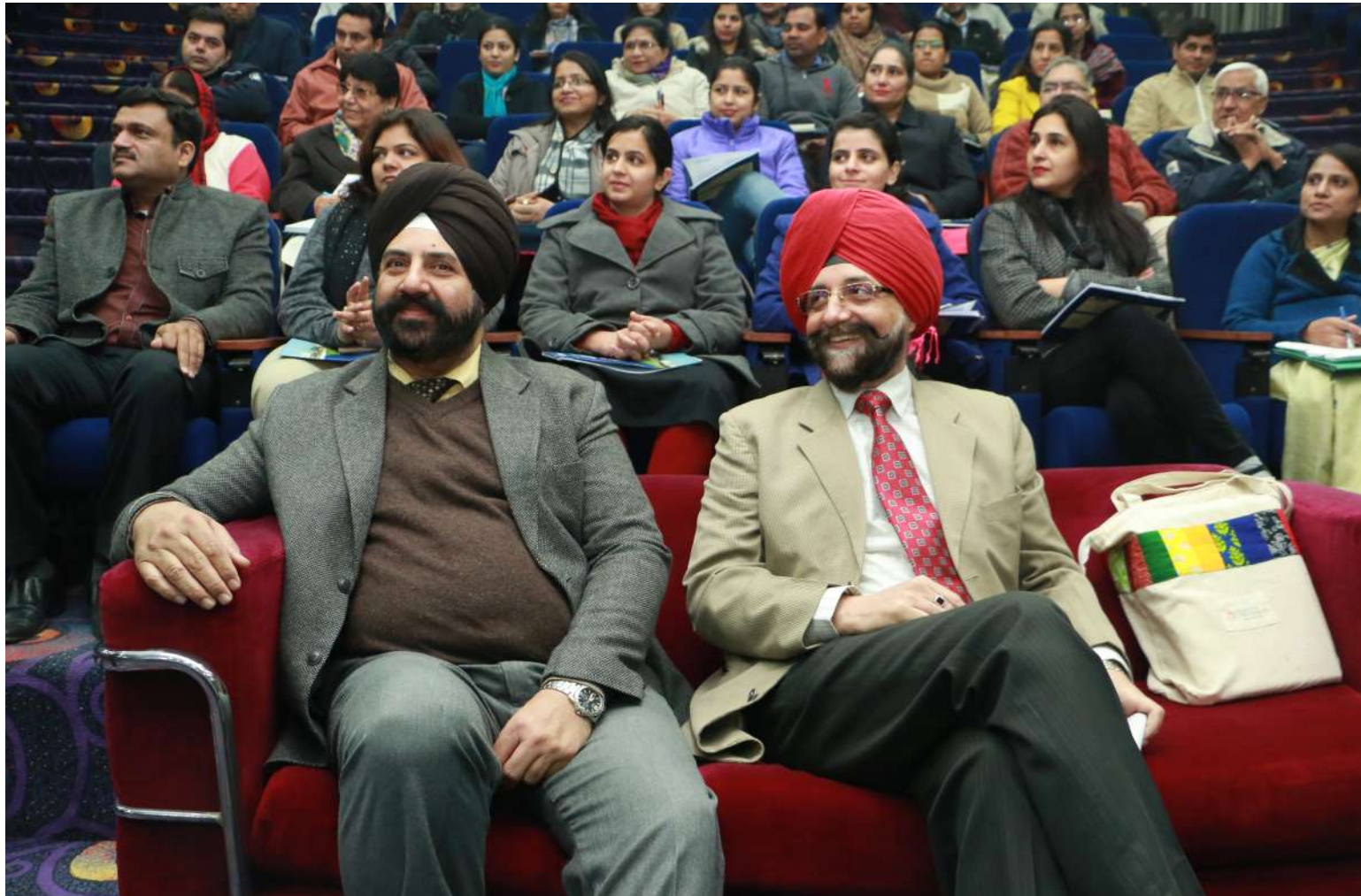
Audience Enjoying the Session