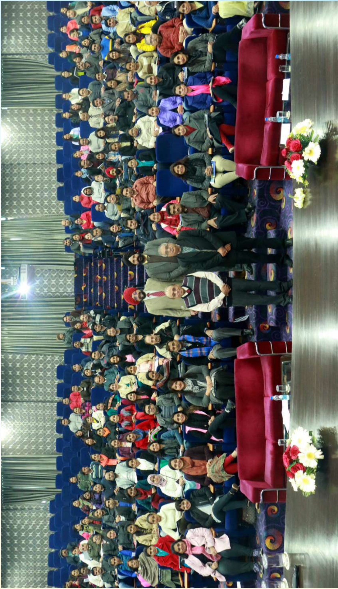
The Faculty Development Programme Team