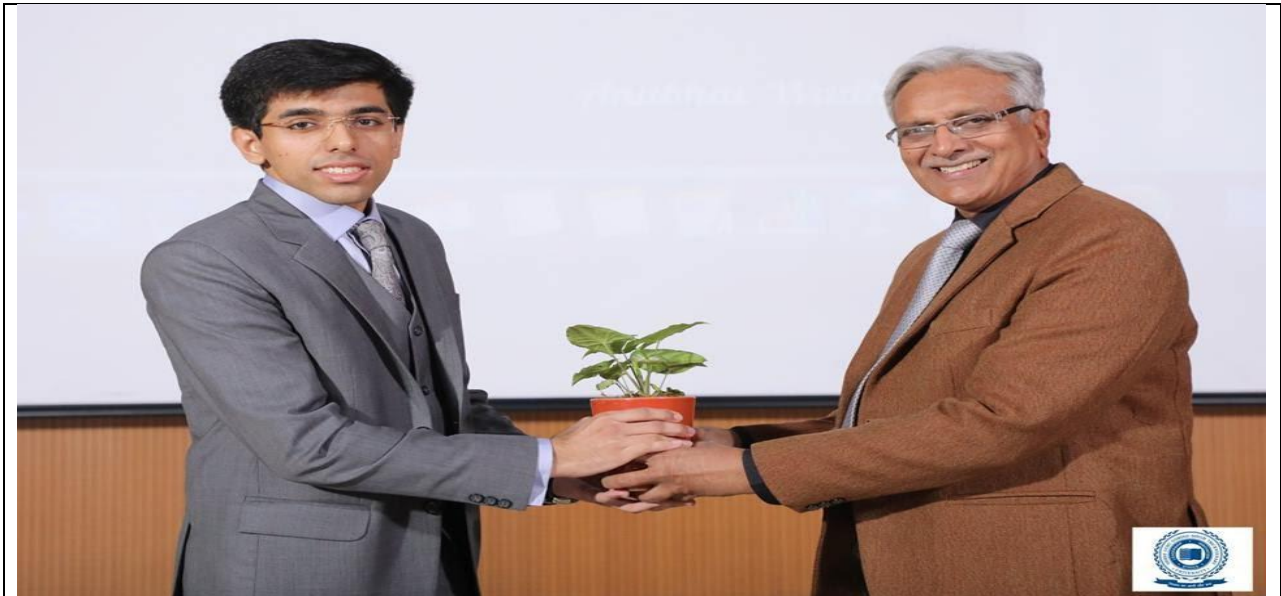
Honb' Pro-Chancellor welcoming the speaker