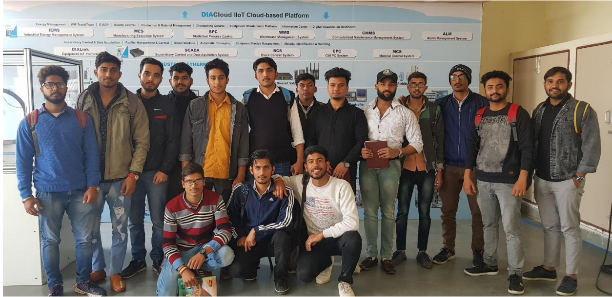
“Mechanical Engineering students at an (NSIC) along with faculty member”