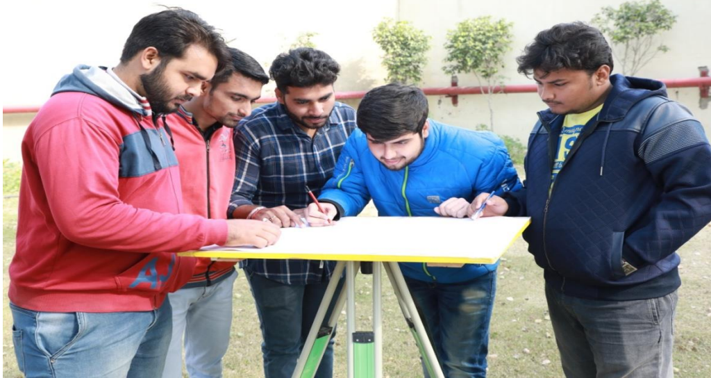
Plane table surveying

Budhera, Gurugram-Badli Road, Gurugram (Haryana) – 122505 Ph. : 0124-2278183, 2278184, 2278185