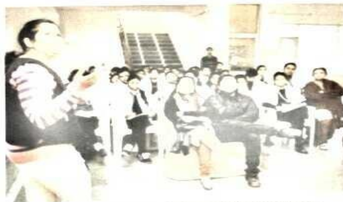
B.Sc., M.Sc students of Behavioural Health Sciences visit Sambandh Foundation, Gurgaon.

The B.Sc. and M.Sc students visited Sambandh Foundation, Gurgaon on 27 th January 2016. This rehabilitation center is home to mentally challenged persons, who are suffering from bipolar and schizophrenic disorders. The students observed that family environment, provided to the inmates, creates a congenial environment for their rehabilitation. The in-house patients were engaged in role play of day to day activities, like welcoming the guests and interacting with them. The inmates presented a play on the issues faced by mentally challenged people and how the society should address their concerns. The Centre presents the best example of psycho-social model of treatment in a family setting. The visit was very useful for the students in terms of experiential learning.