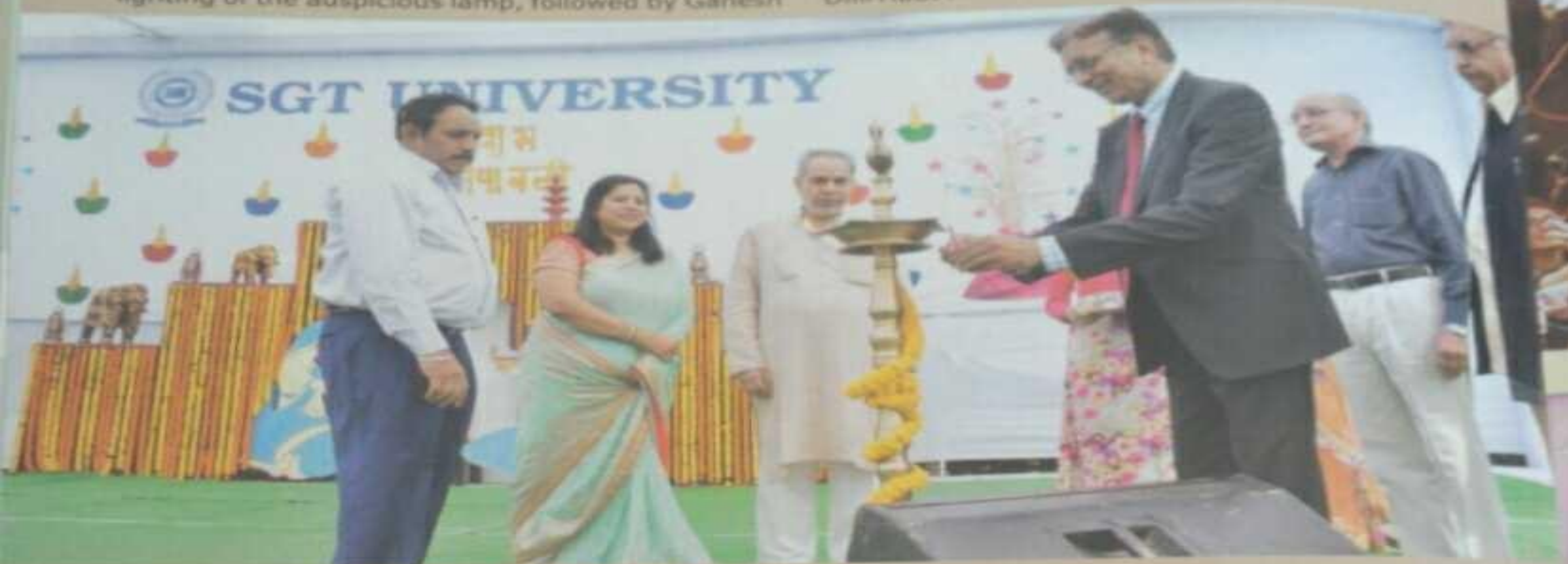
University dignitaries Commencing the Program of Diwali Fest "2015" the Lighting of Auspicious Lamp.

Vandana and folk dances including Gandra, Rajasthani dance & Bhangra etc. The fest also had multiple stalls of eatables and other handicraft items. The food stalls were from the various popular joints and special stalls of handicrafts, junk jewellery etc. were from popular tourist places like Dilli Haat.