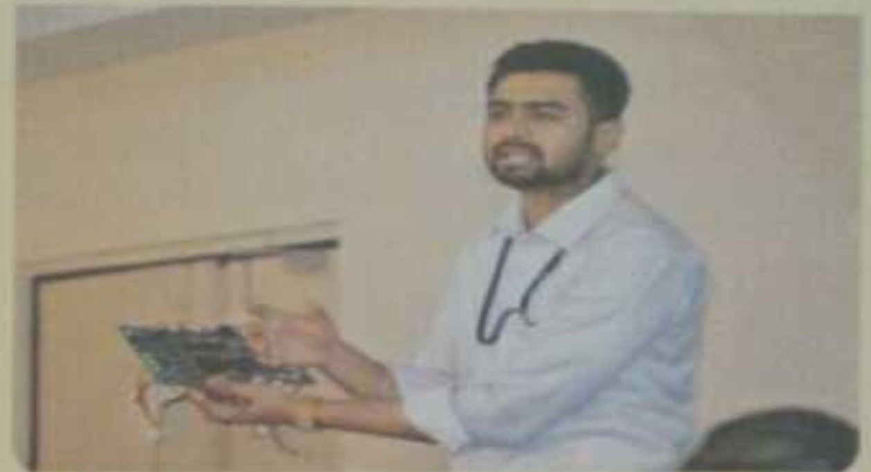
Experts from Sofcon India Pvt. Ltd. addressing the students of Electronics and Communication Engineering.