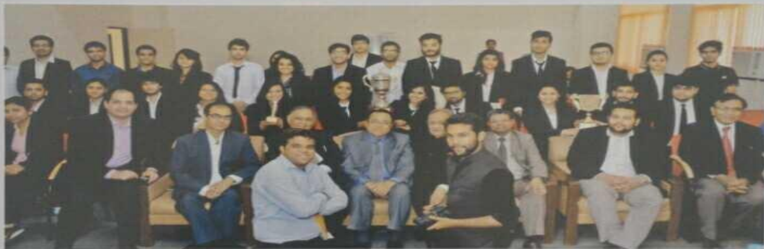
Participants with Judges of Moot Court.