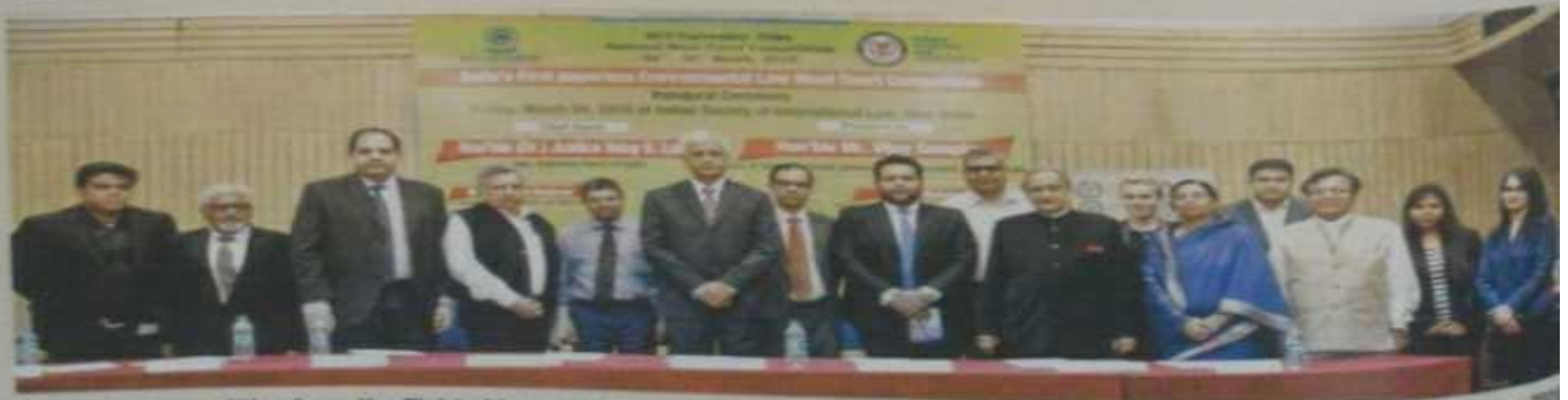
Eminent Personalities from the Field of Law at SGTU for the "Complete Paperless Environmental Law Moot Court Competition 2016"