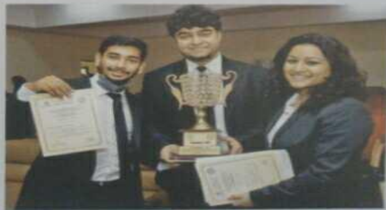
Students won the competition at First Paperless Environmental Law National Moot Court Competition.