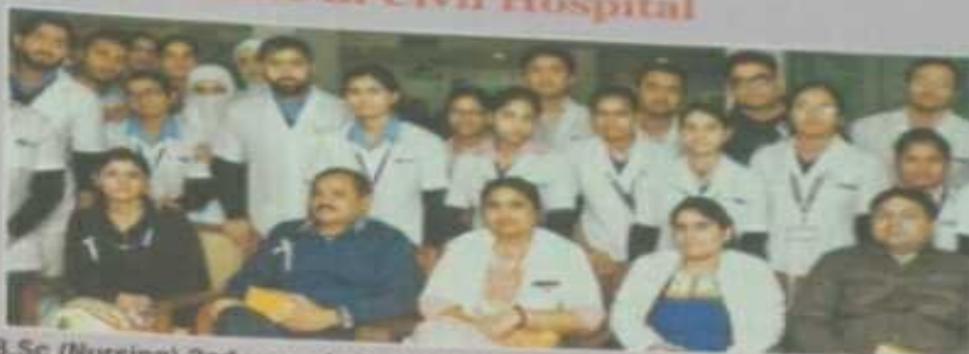
B.Sc (Nursing) 2nd year students in Civil Hospital Gurgaon for a "Health Talk".

B.Sc. (Nursing) 2 nd year students were posted in Civil hospital, Gurgaon in the month of December 2015. On 21 st Dec. students attended a health talk in OPD on "AIDS", "Tuberculosis", "Malaria" and "Swine flu". The objective of health talk was to educate the group regarding preventive measures in health related practices to promote health as well as to restore health of the community.