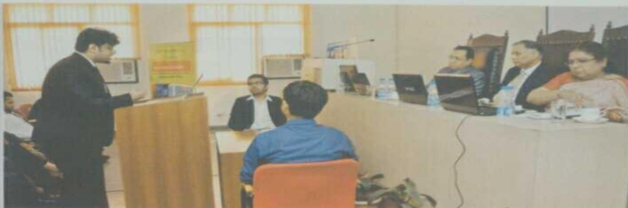
Students participating in the competition