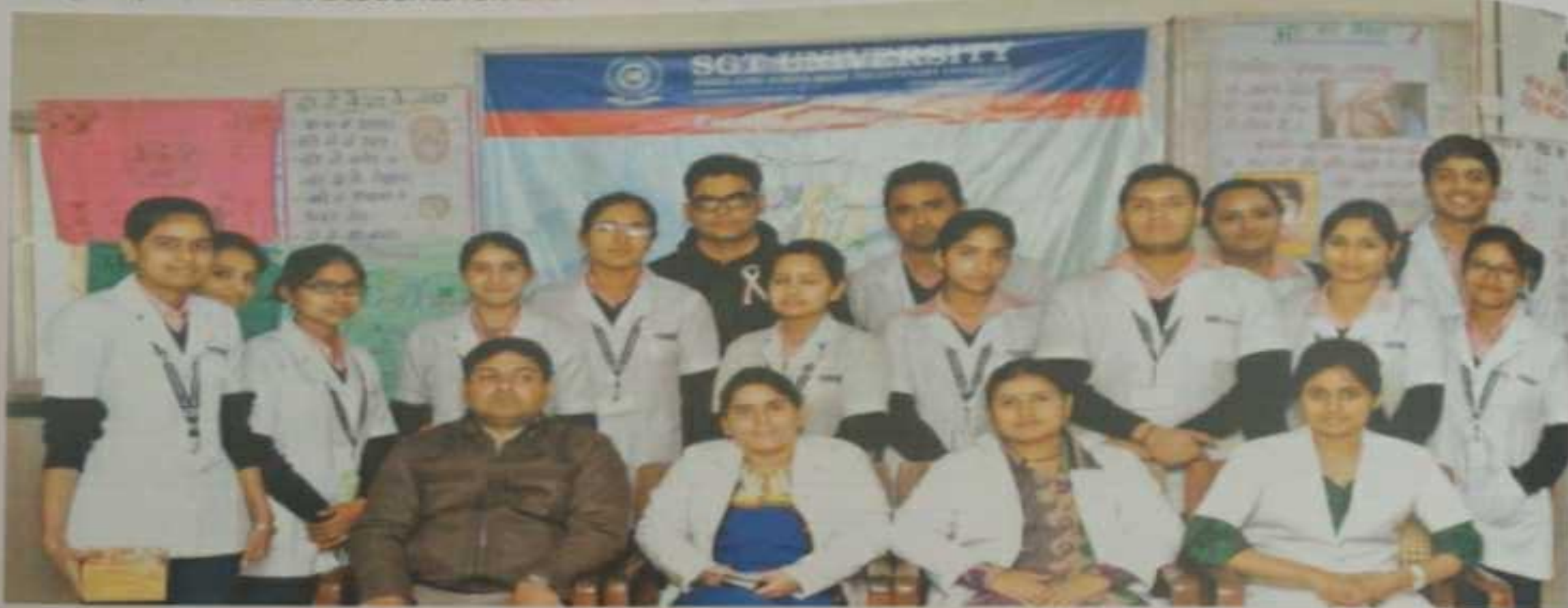
Participants at RML Hospital, New Delhi

experience and exposure for them to learn new aspects of Palliative care in nursing management of the affected client with life threatening diseases. "Can Support" offers a spectrum of services for the care of cancer patients.