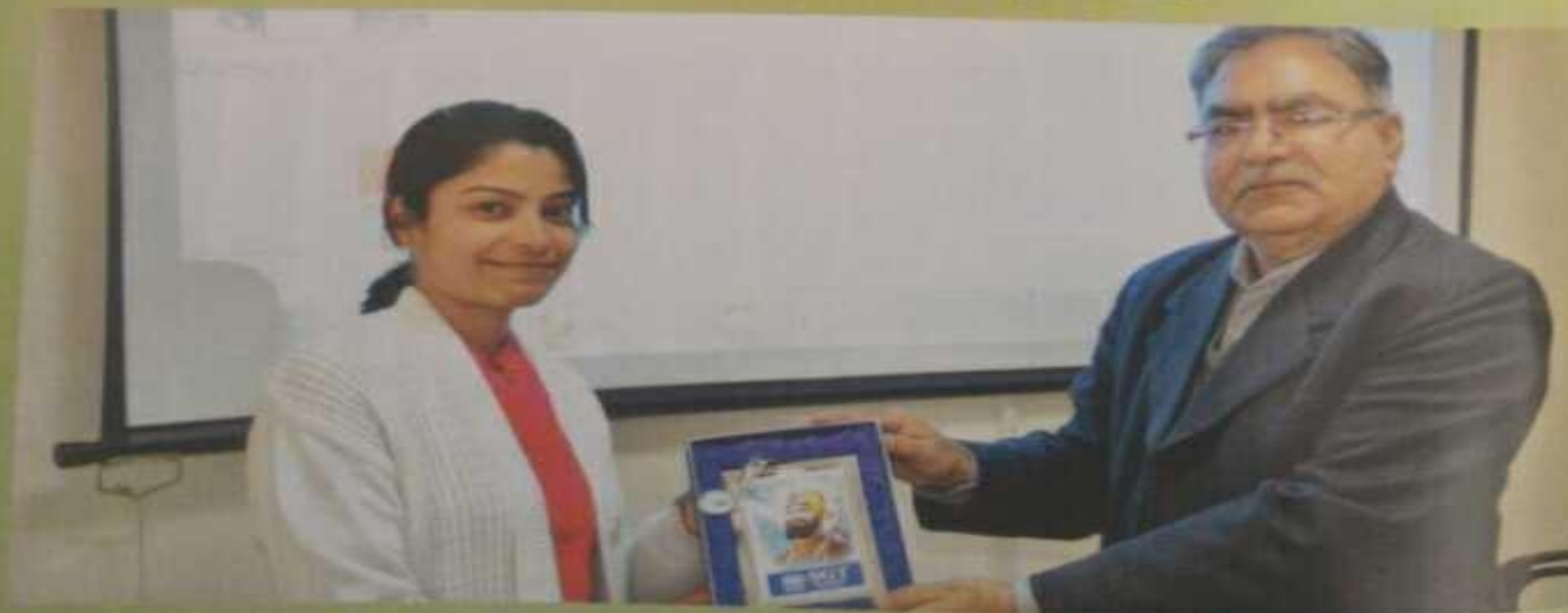
Dean Faculty of Allied Health Sciences felicitating the...

and 5 th February, poster competition and 'use from waste' competition were organized which witnessed enthusiastic participation of the students. The events were a total blend of knowledge, awareness, creativity, innovation along with use of techniques. The exhibition of posters, artifacts and models was visited and assessed by Hon'ble Vice-Chancellor, Dean Engineering, Dean Allied Health and Dean, Community Medicine.