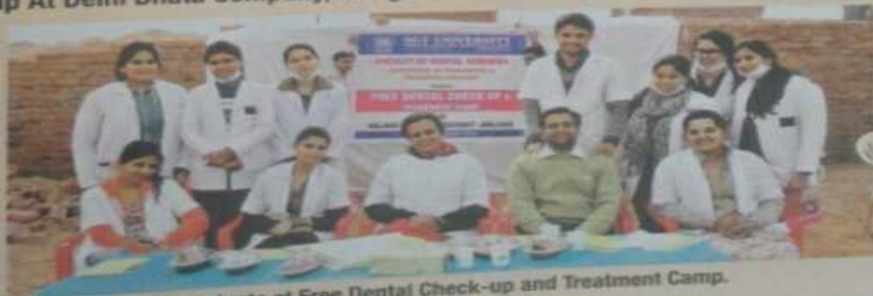
Free Dental Check-up and Treatment Camp.

Department of Pedodontics & Preventive Dentistry in collaboration with Department of Community and Periodontology conducted a free dental check up and treatment camp at Delhi bhata company, Village Bamnola, Jhajjhar district on 13 Jan 2016.