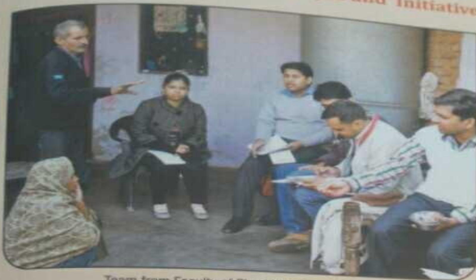
Team from Faculty of Physiotherapy at Budhera

Faculty of Physiotherapy is a part of Budhera project where the village Budhera has been adopted by the SGT University to help and serve the people of the village. A team of Physiotherapists which includes the Faculty, interns and final year students regularly visits the village where they evaluate, diagnose and treat the patients in need of physiotherapy and educate them about ergonomics. The primary objective of this exercise is to offer a helping hand to the villagers of Budhera and it is expected that within a short span of time SGT University would be able to improve the quality of life in the village.