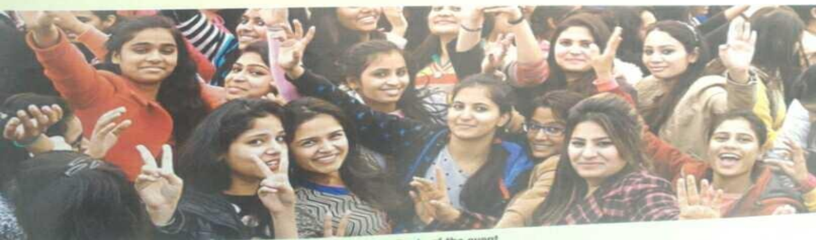
A group of students at the event