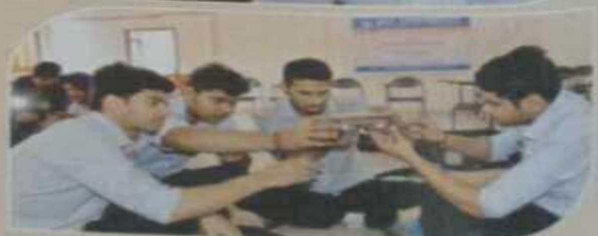
Students of Engineering CSE Department participating in Workshop