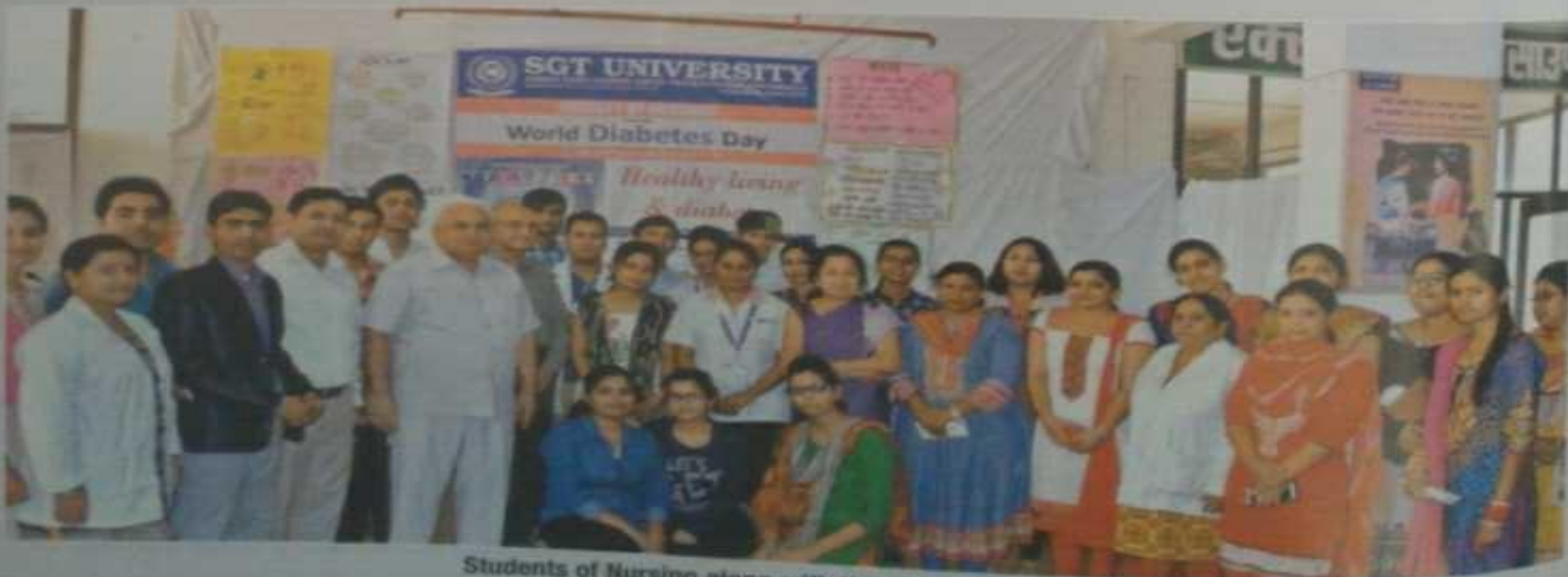
Students of Nursing along with the University Officials

On 14 th November 2015, Faculty of Nursing organised "World Diabetes Day" on the theme " HEALTHY LIVING & DIABETICS " at SGT Hospital, Gurgaon. The motive was to create an awareness about diabetes among the masses.