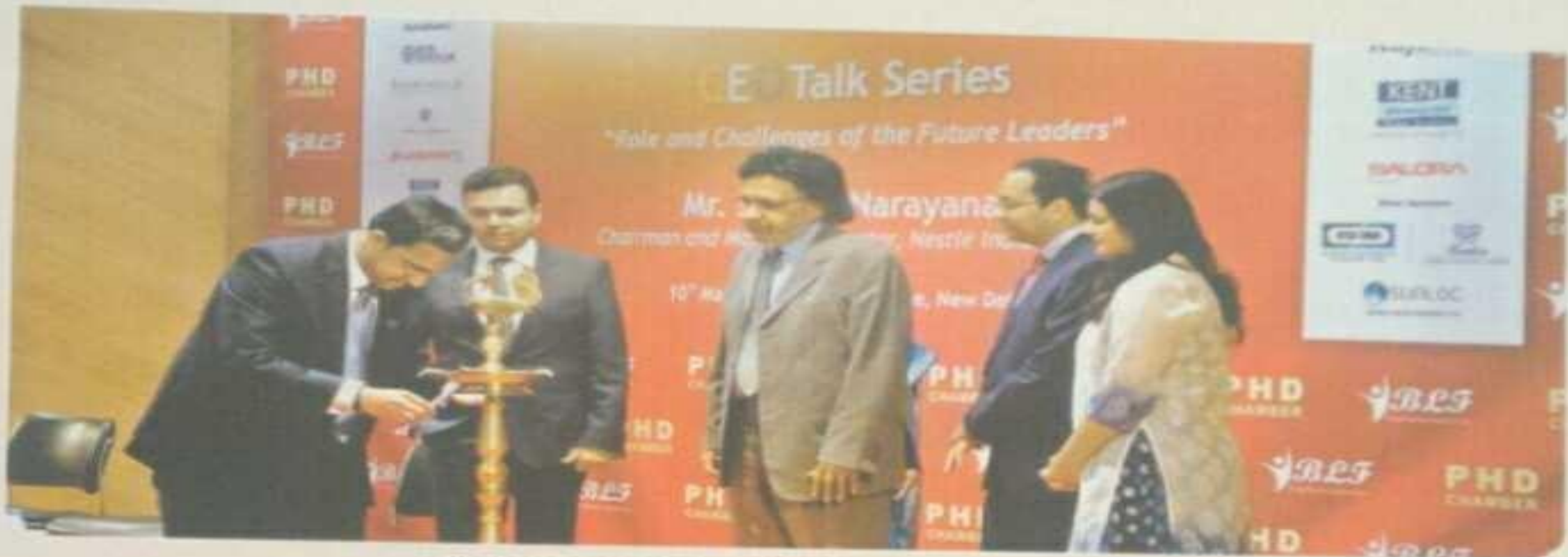
Dignitaries during the Lamp lighting Ceremony at Alicon Ltd.

were excited to relate theoretical concepts of Production and Operations Management with practice.