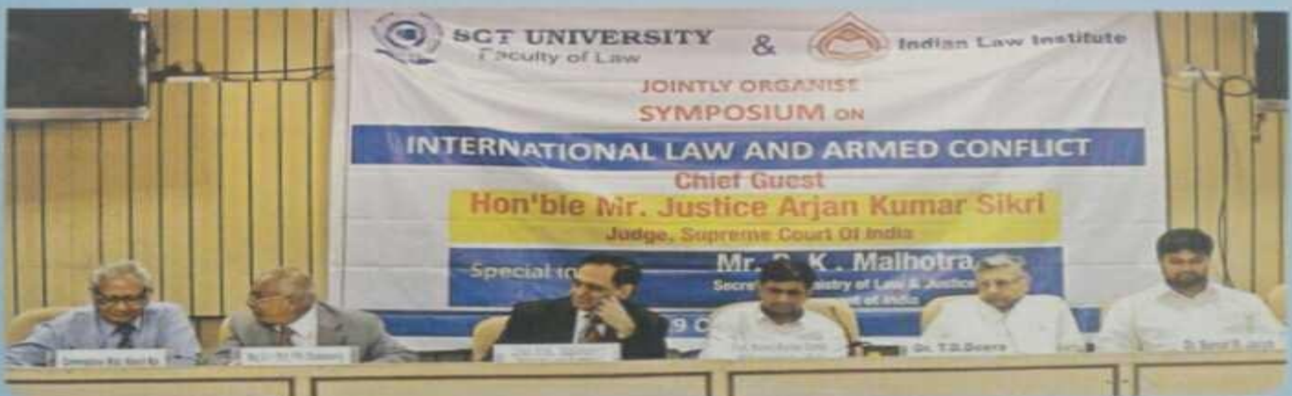
Eminent Key Speakers at SGTU "Symposium"