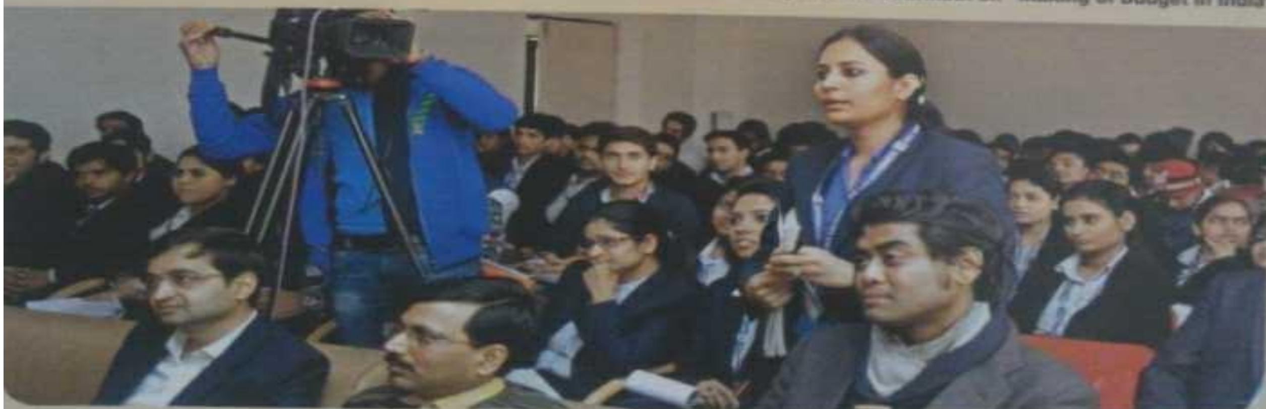
Students interacting with the guest speaker during the session