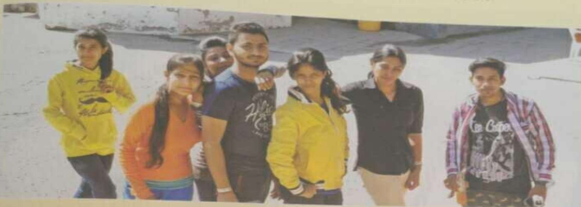
SGTCP students at Kufri (Shimla)

The students visited Kufri, Fun City Park, Mall Road, and Church at Shimla, where they had wonderful opportunity to learn many lessons of life while playing in the lap of Mother Nature.