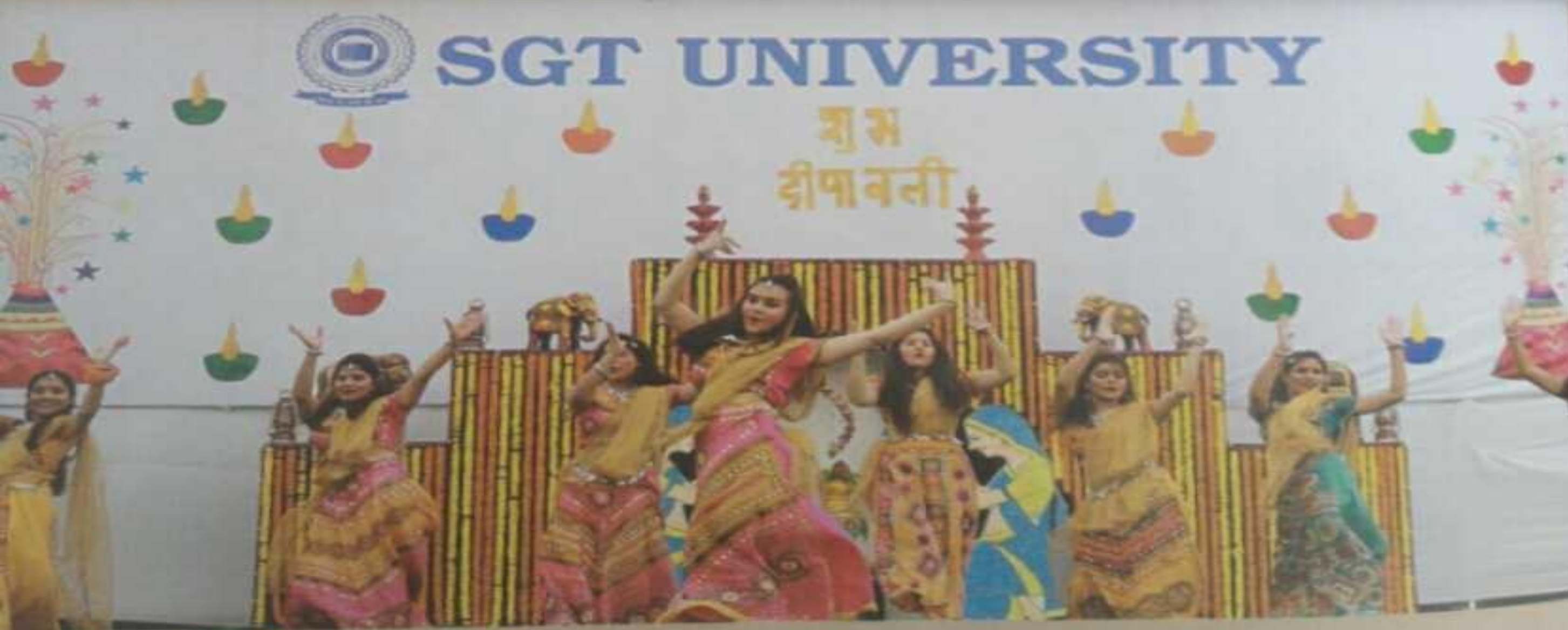
Students from different departments participation in Various Styles in Diwali Fest "2015".