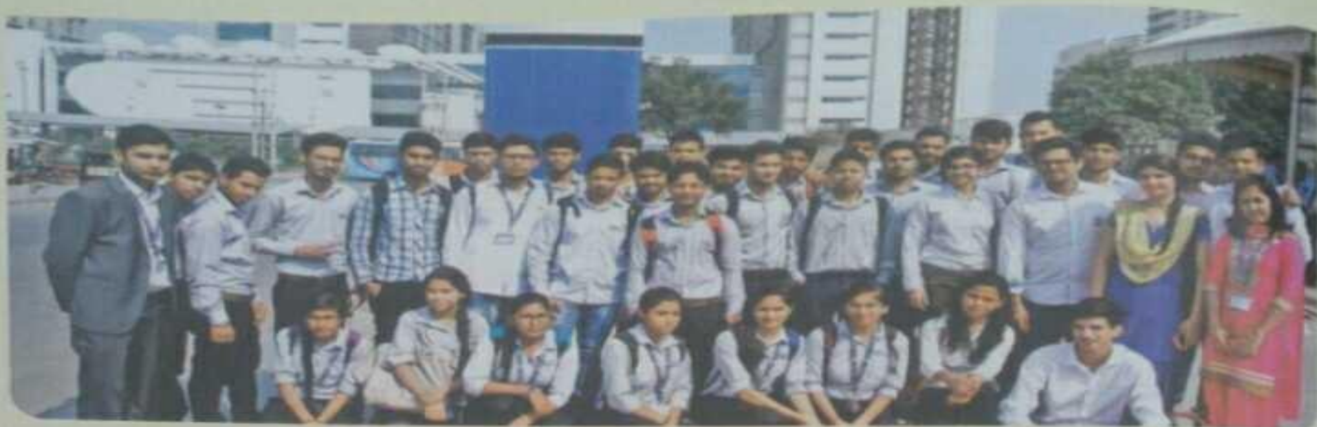
Students of B.Tech (CSE) during the Industrial Visit.