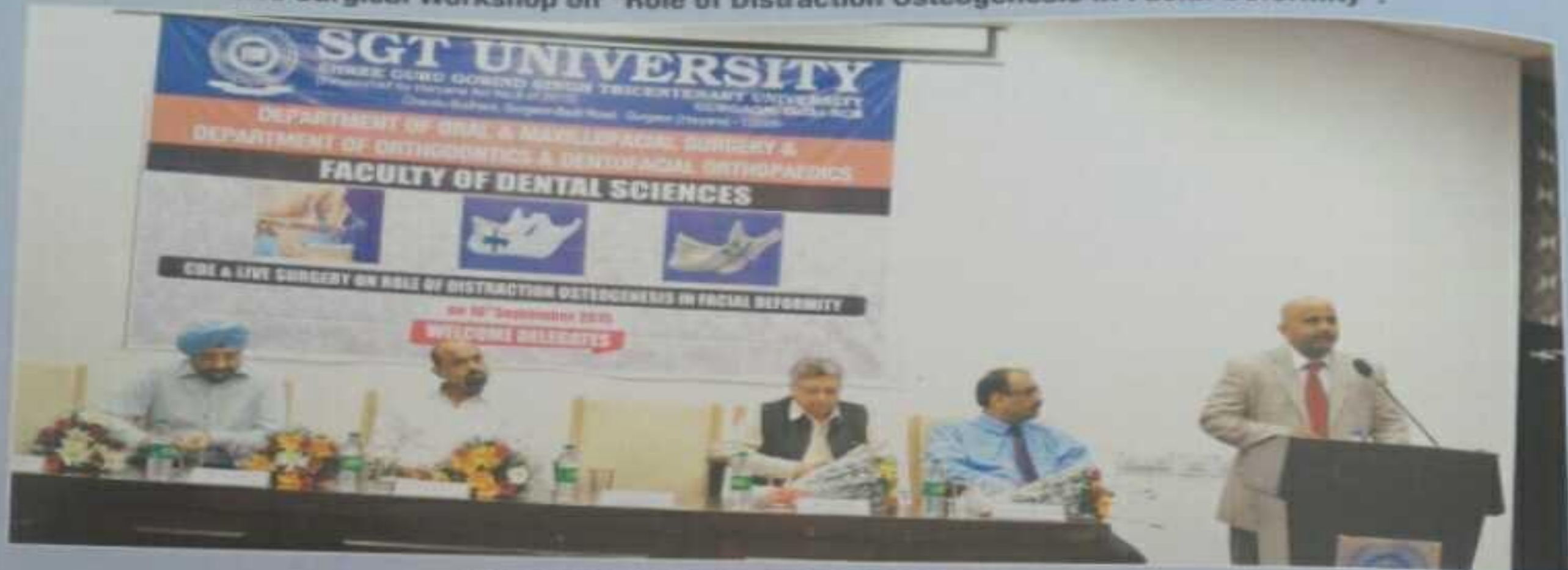
Eminent Personalities from the Field of Dentistry at SGTU

Live Surgical Workshop on "Role of Distraction Osteogenesis in Facial Deformity".