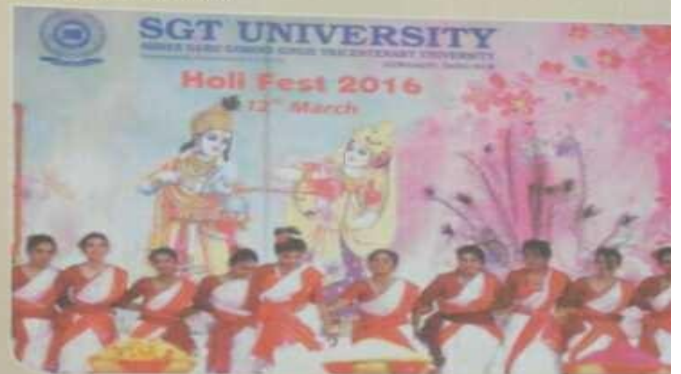
Students performing Bihu Dance Style.