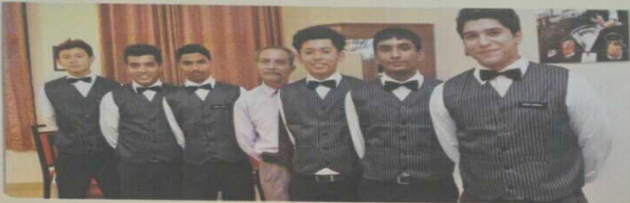
BHM 1 st Year Students participating in Workshop.

the meal, understanding the table setting, the napkin, types of cutlery, holding cutlery, rest position, finished position and some common terms like "aperitif", "entrée" were discussed in detail during the workshop.