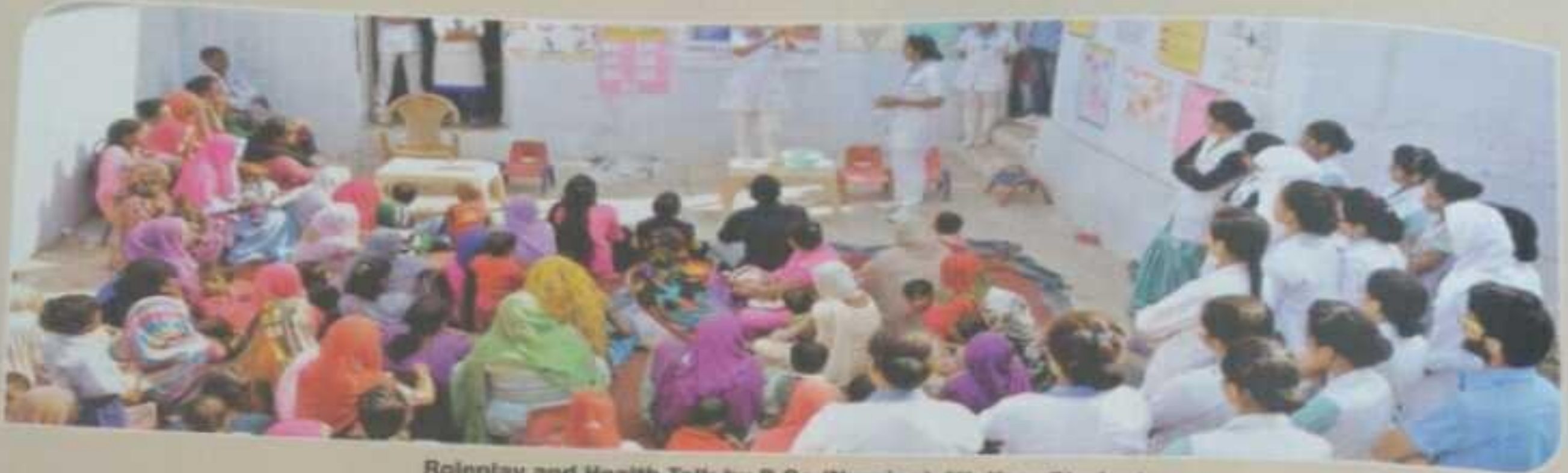
Roleplay and Health Talk by B.Sc (Nursing) 4th Year Students

Health Inspector, ASHA workers and local people of Farukh Nagar. At the end of the programme, feedback session was conducted, in which questions of the participants were answered and gifts were distributed.