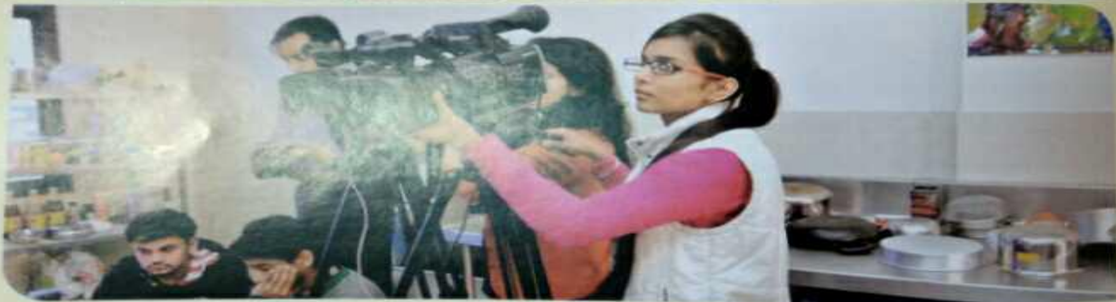
Stills from the shoot of "Khansaama" 1st Episode.