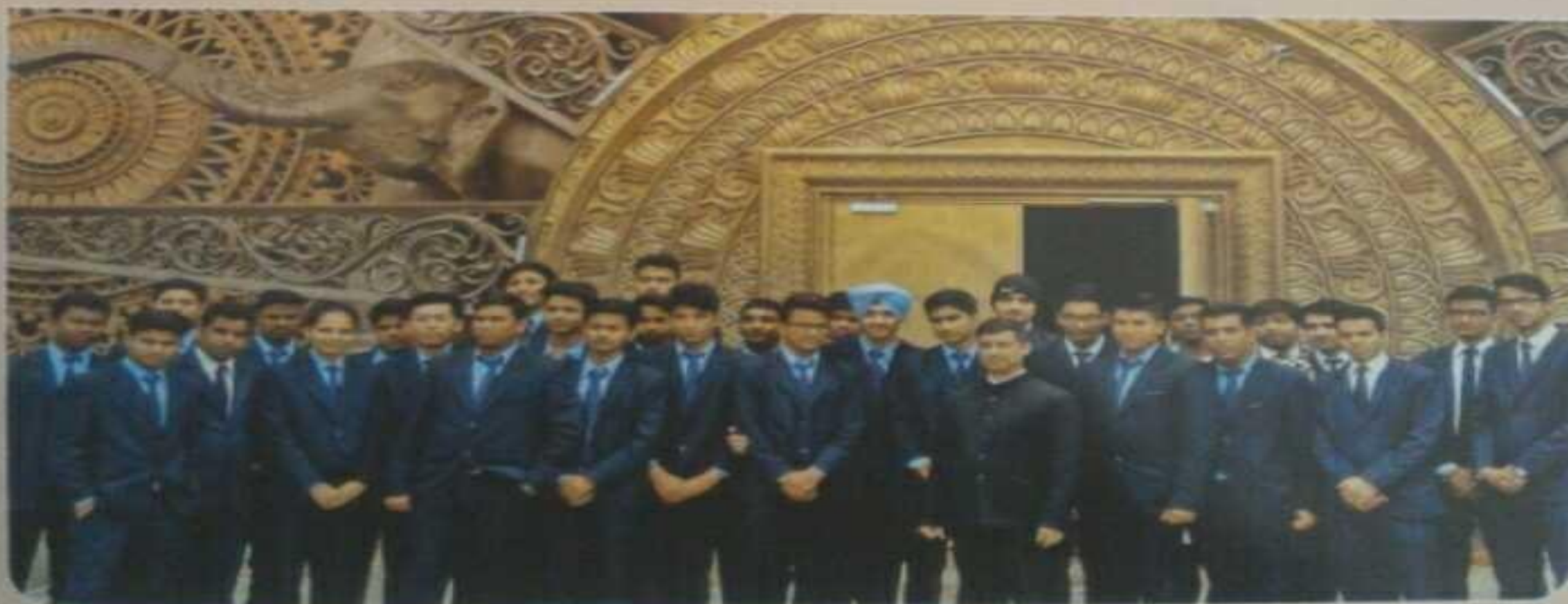
An informative trip to Kingdom of Dreams by the faculty of Hotel and Tourism Management.

leisure destination. It consists of two theatres, Nautanki Mahal and the Showshaa Theatre , and a cultural and cuisine area known as Culture Gully . The grandeur and magnificence of the place was much appreciated by the students.