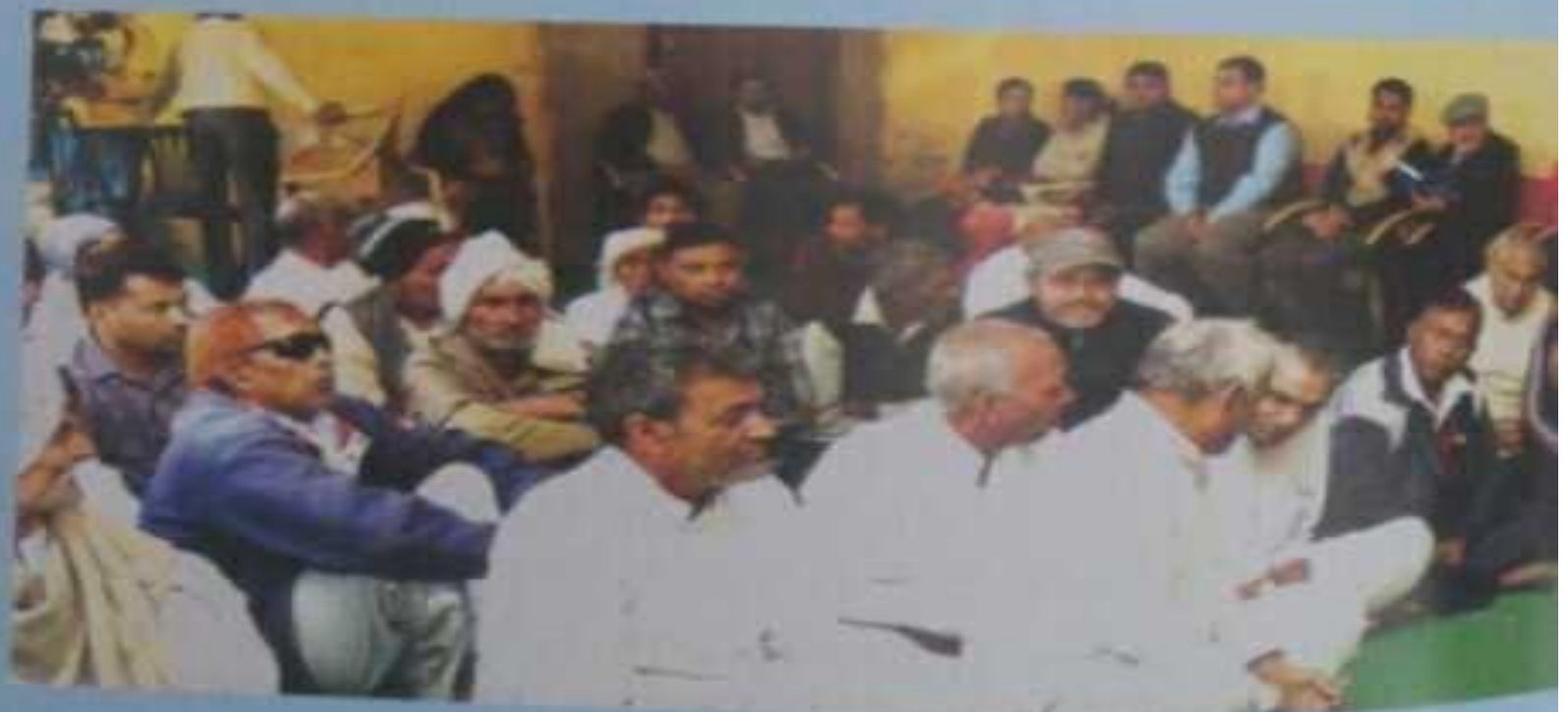
Budhera Villagers during the Dental Survey.

Dental survey for village Budhera under Swa-Prerit Adarsh Gram Yojana has been initiated under which a door-to-door survey covering complete family was being conducted. A meeting with the villagers was also organized on 13 th December 2015 in order to form committees involving the village members and also to understand the needs of the villagers.