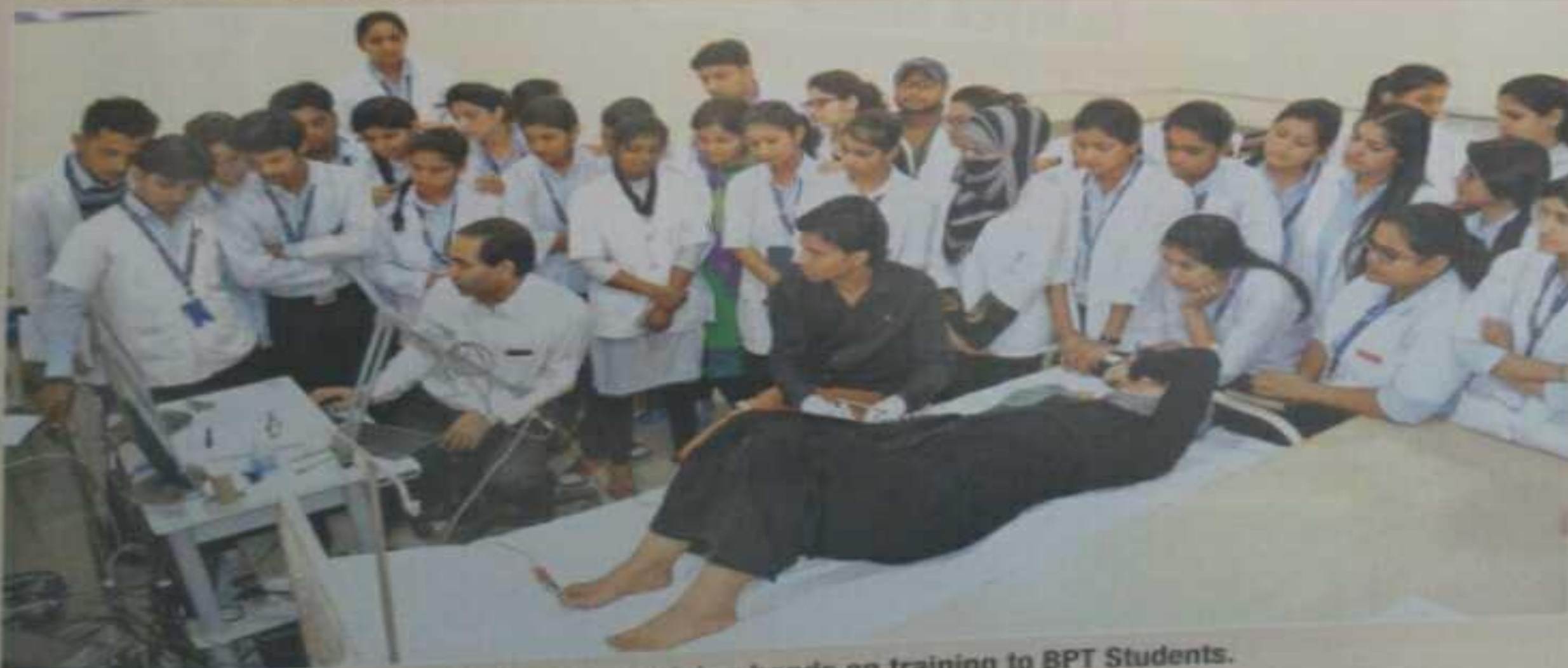
Hands on training to BPT Students.