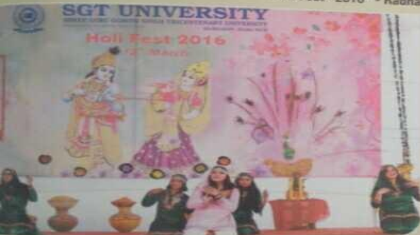
Students performing Kashmiri Dance Style.