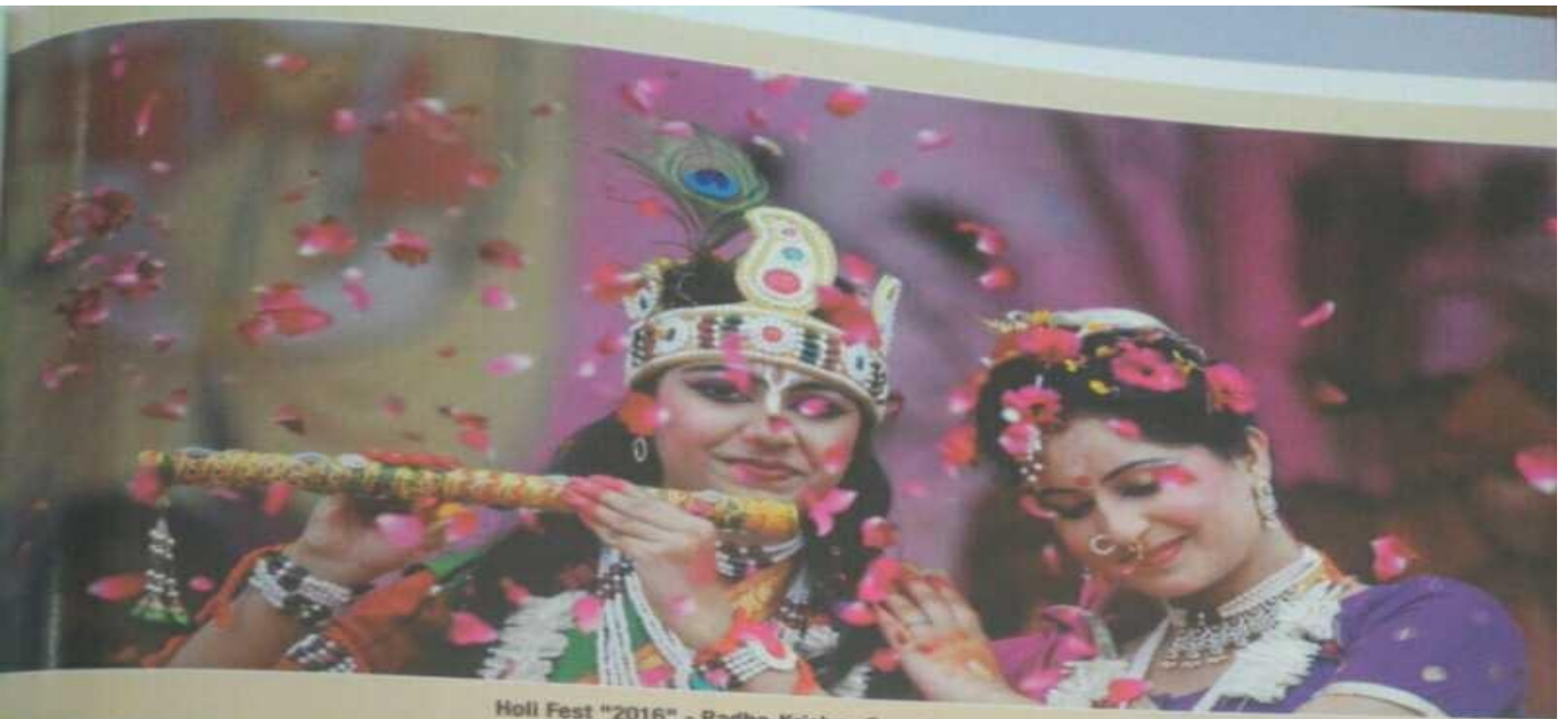
Holi Fest "2016" - Radha-Krishna Sang Phoolon Ki Holi.