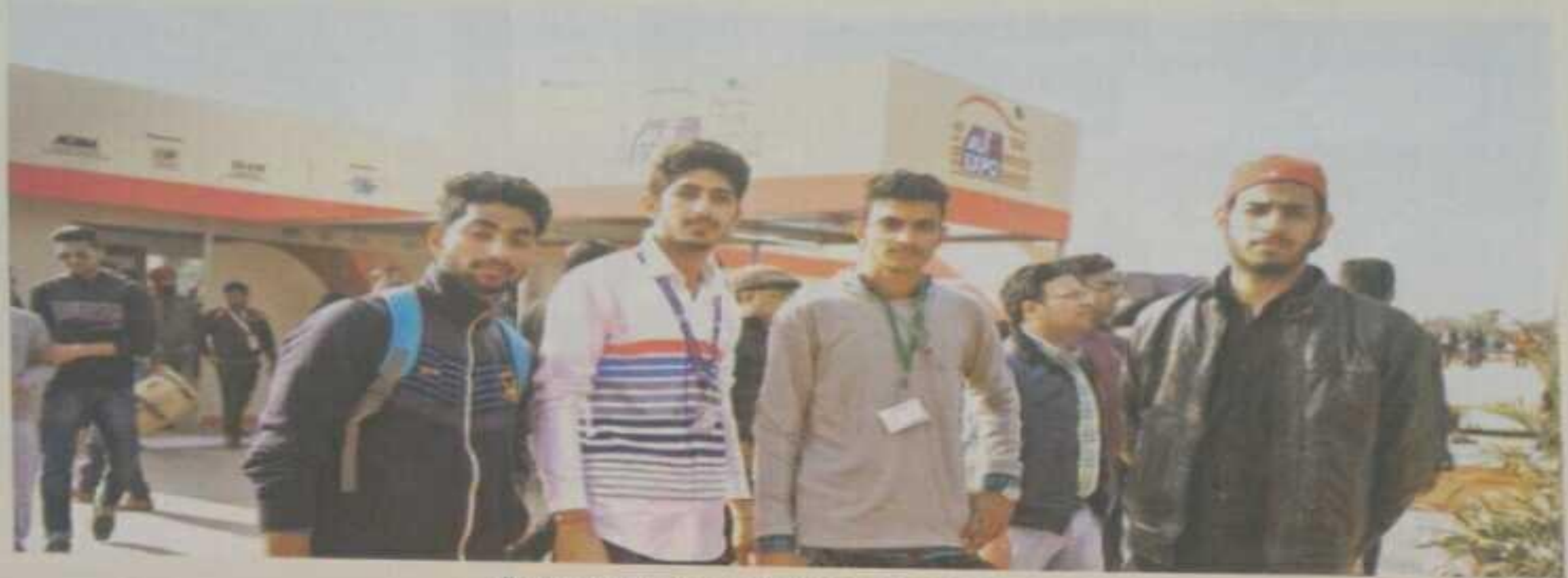
Students of B.Tech. (ME) during the Auto Expo

about the concept of cars which are designed in accordance with the demand i.e. more fuel efficient and based on alternative fuel. The students had wonderful opportunity to learn about new technologies.