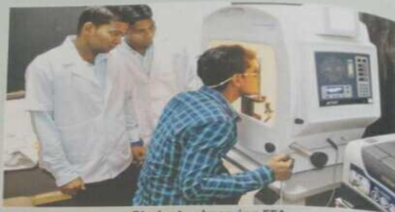
Students observing FFA

On 1 st of March 2016, Students of Optometry [2 nd and 3 rd year] were taken to Mahajan Eye Center, Pitampura New Delhi for an educational excursion. Students were exposed to different procedures such as A Scan by Emersion Technique, Non-Contact Tonometry, OCT-posterior segment, YAG laser, Pentacam and Fundus Fluorescein Angiography. They learnt the details of the technique of doing FFA, OCT, Pentacam, NCT etc. Students felt delighted as they were experiencing these techniques live for the first time.