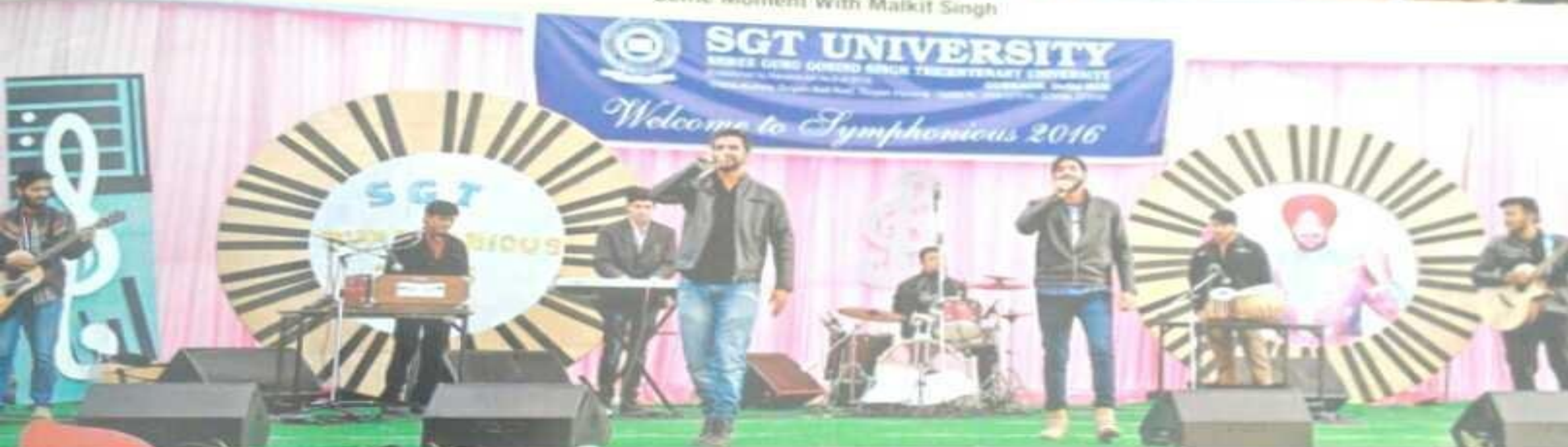
Students performing on the stage