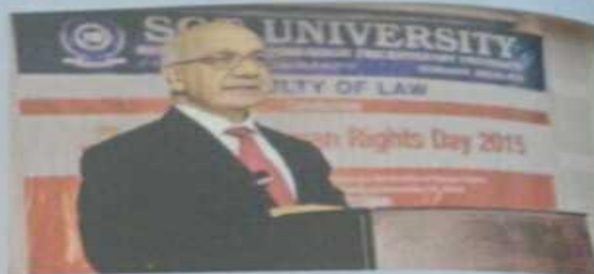
Mr. Virendra Sharma, Member of the Parliament, U.K.