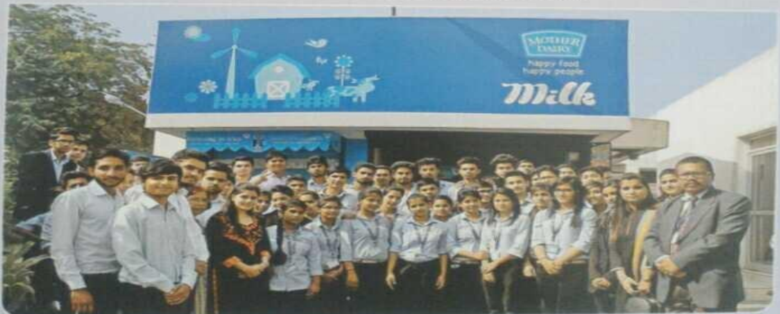
Students of FCM at Mother Dairy for Industrial Interaction.

Industry interaction is a part of Academic Culture at Faculty of Commerce & Management- SGT University, since it is the need of the hour....Students of FCM at Mother Dairy