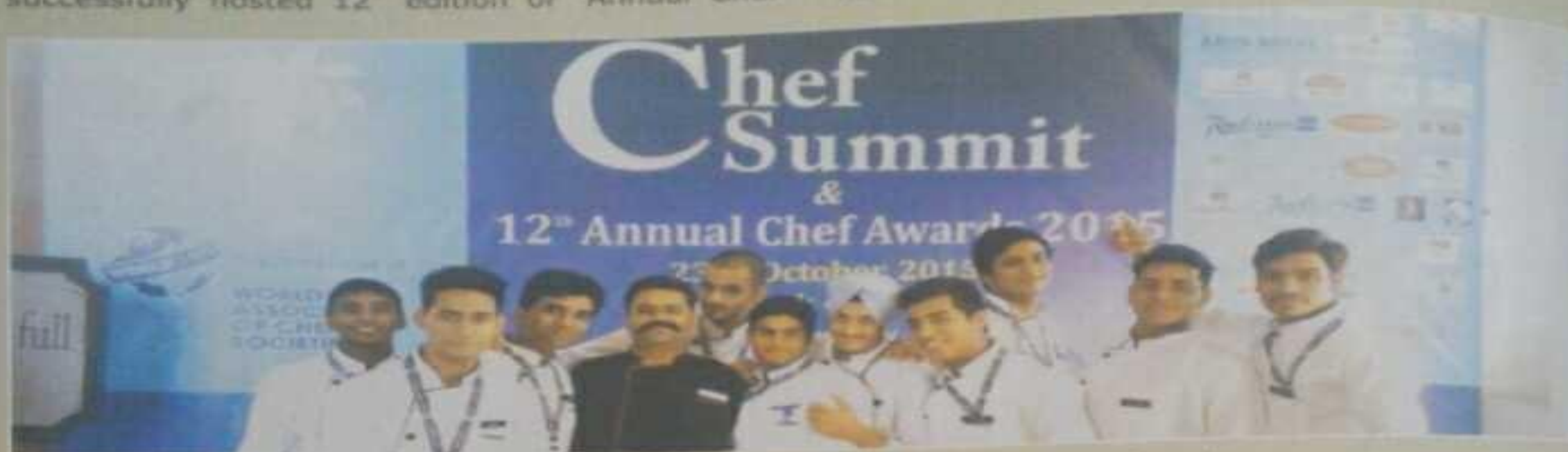
10 Selected Students of BHM 1st year in International Chef Summit.

Awards 2015", in association with the Indian Federation of Culinary Associations and World Association of Chef Societies. The students got their first experience to listen to and see in person the talks from the crème de la crème of culinary world.